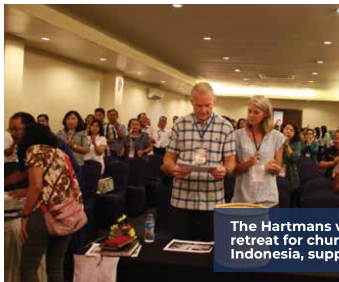
The Hartmans visit a retreat for church leaders in Indonesia, supporting the mission field.