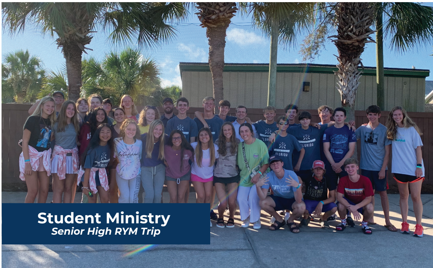
Student Ministry Senior High RYM Trip