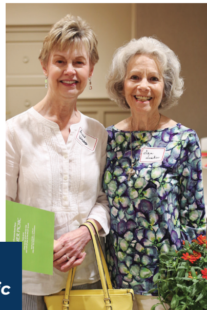
Women's Ministry Mother/Daughter/Sister/Friend Picnic