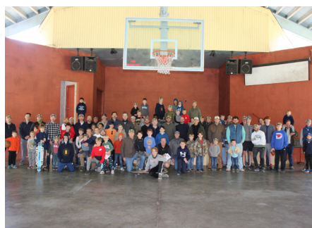
Father and Son Retreat at Twin Lakes