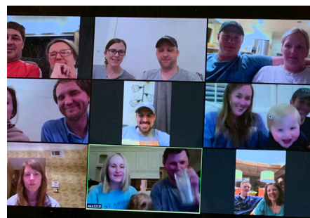
Lots of ZOOM Fellowship