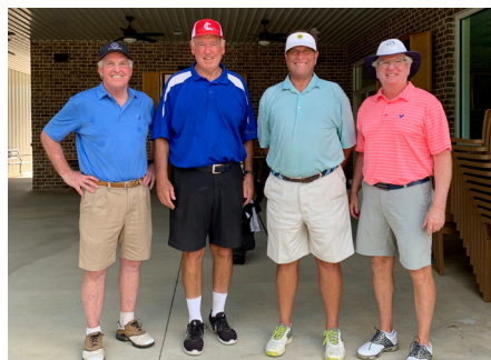
FPC Men's Golf Scramble