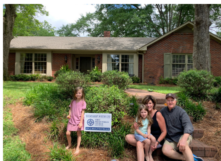
FPC Sign Outreach