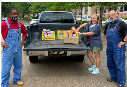
D Group Outreach